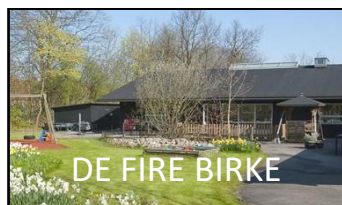
DE FIRE BIRKE